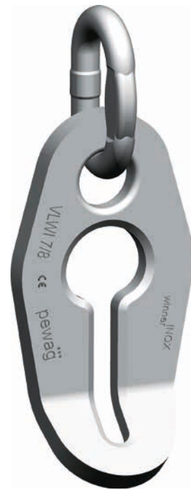
VLWI Chain shortener

Preferred areas of application for the VLWI shortener are water and wastewater applications and the product can also be used in connection with chemicals and food products; however, restrictions will apply and we recommend that you contact the manufacturer for advice prior to exposing the product to such use.