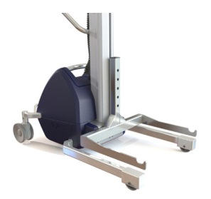
Fork for shafts

Ergonomic reel handling. Lift and transport reels onto shafts and machines without effort.