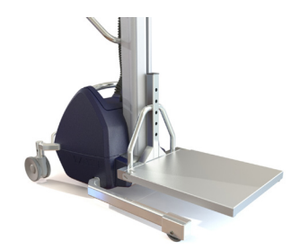
Fold up platform

Easy handling of reels from their outer surface.