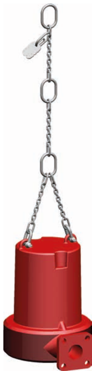
PCWI with 2-legs in the end