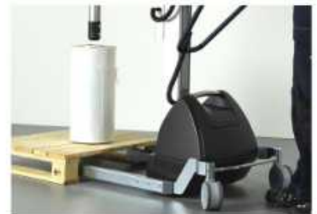
TAWI Lifting Trolleys

On several models, the measures of the wheels make it possible to drive the lifter into a Euro-pallet in three different ways.