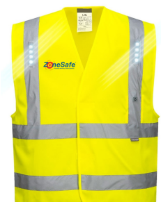
Optional Hi Viz Vest