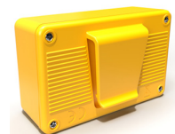
Back of the P2P VibraTag has a clip to attach it to clothing.