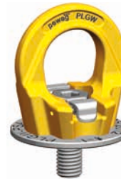
PLGW-PSA supreme for tool-free assembly

Every anchorage point is marked with the thread length and the permitted number of persons. The individual serial number enables complete documentation on all compulsory inspections.