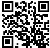
Mounting video PLGW supreme

You can find more information on the functionality either by watching the video on our homepage ( www.pewag.com ) or by reading the operating instructions.