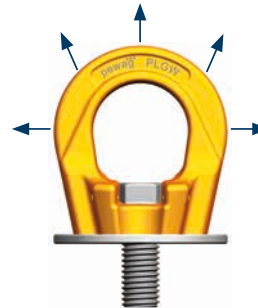
Loadable in all directions